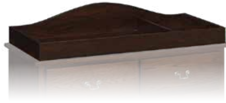
#108 • 50" Removable Changing Station