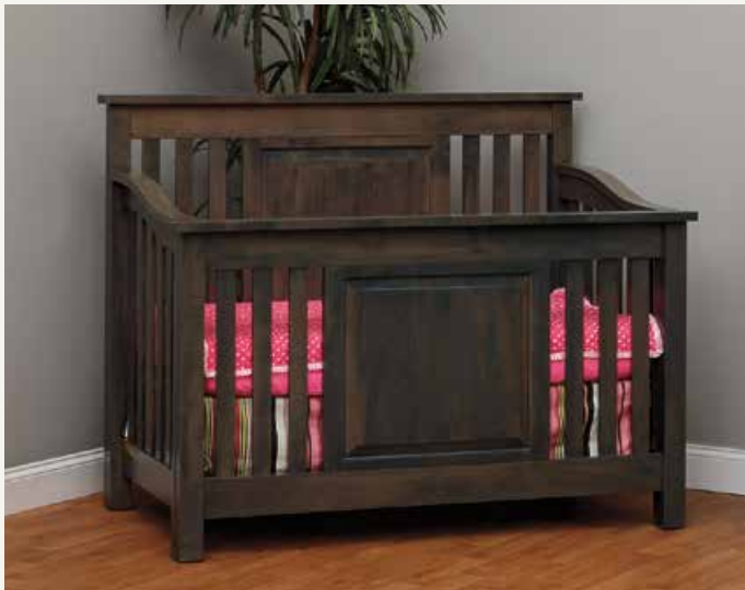
#501 • Crib 58½"w x 31¼"d x 46¼"h