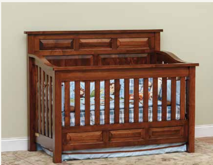
#401 • Crib 58½"w x 31¼"d x 46¼"h