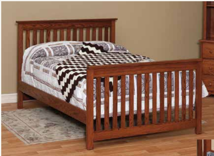
#103 • Full Sized Bed Conversion Kit Includes bed rails, slats, and hardware to easily convert crib into a full sized bed.