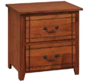
#112 MA • 2-Drawer Nightstand 24½"w x 18"d x 25½"h