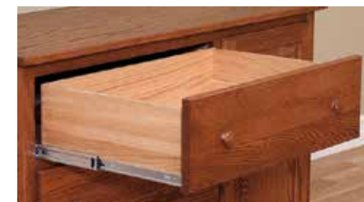
Full Extension Slides and Dovetail Drawers!