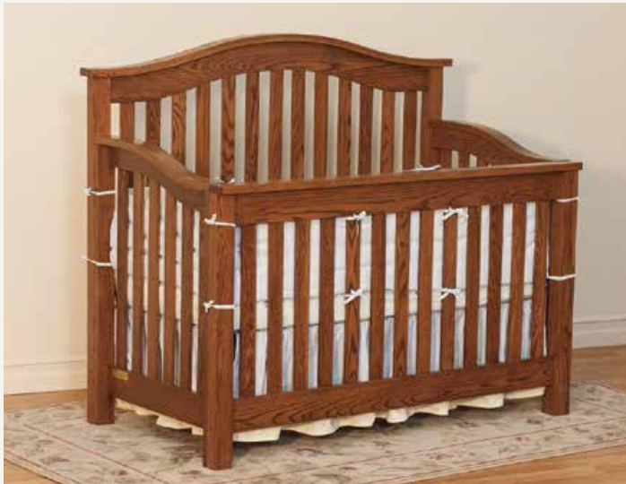
#201 • Crib 58½"w x 31¼"d x 50½"h