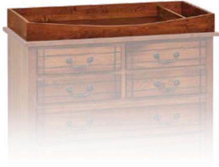
#113 • 42" Removable Changing Station