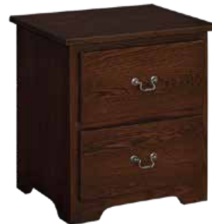
#112 SH • 2-Drawer Nightstand 24½" w x 18" d x 25½" h