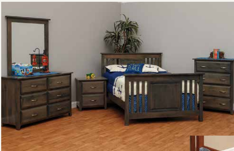
#103 • Full Sized Bed Conversion Kit Includes bed rails, slats, and hardware to easily convert crib into a full sized bed.