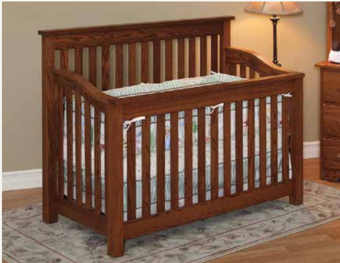
#101 • Crib 58½"w x 31¼"d x 46¼"h