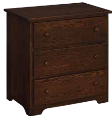
#111 SH • 3-Drawer Chest 34" w x 20" d x 33¼" h