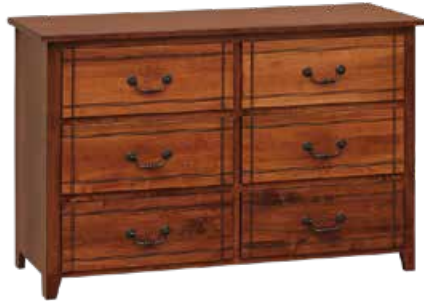
#107 MA • 6-Drawer Changing Dresser 50¼"w x 20"d x 33¼"h