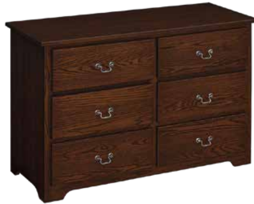
#107 SH • 6-Drawer Changing Dresser 50¼" w x 20" d x 33¼" h