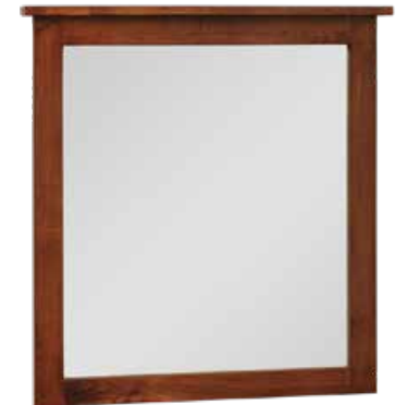
#114 • Mirror