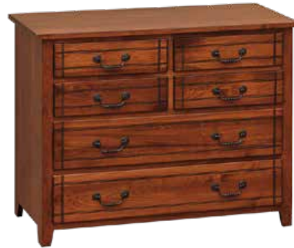
#106 MA • Changing Dresser 42"w x 20"d x 33¼"h