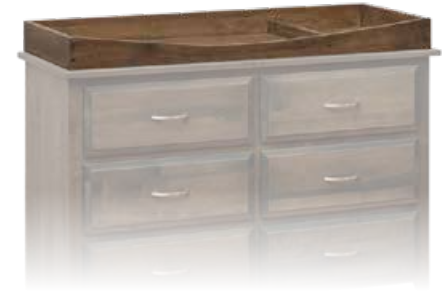
#117 • 50" Removable Changing Station