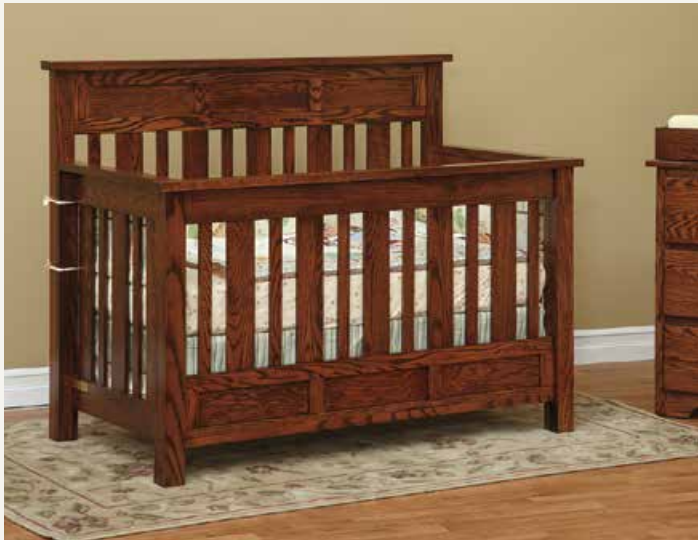
#301 • Crib 58½"w x 31¼"d x 46¼"h