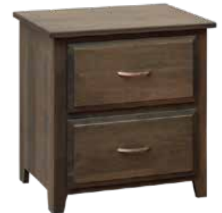
#112 HA • 2-Drawer Nightstand 24½"w x 18"d x 25½"h