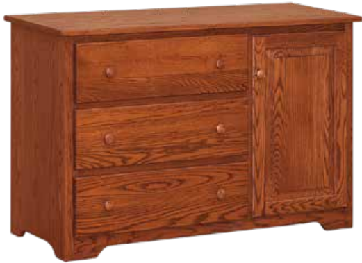
#105 SH • Changing Dresser 50¼" w x 20" d x 33¼" h