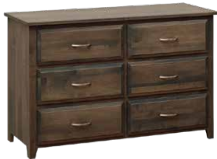
#107 HA • 6-Drawer Changing Dresser 50"w x 20"d x 33¼"h