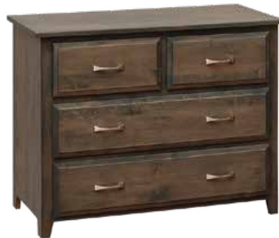
#115 HA • Changing Dresser 42"w x 20"d x 33¼"h