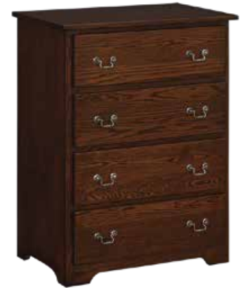
#110 SH • 4-Drawer Chest 34" w x 20" d x 42½" h