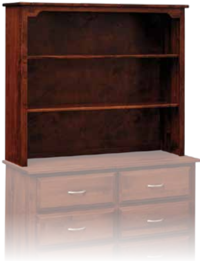
#109 • Hutch Top