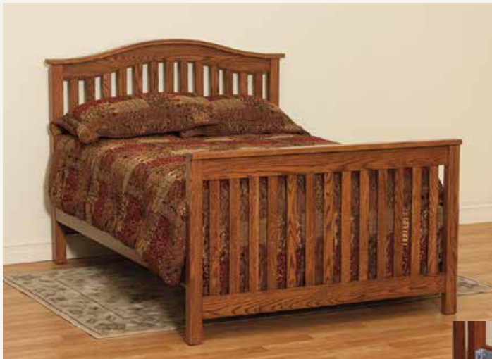
#103 • Full Sized Bed Conversion Kit Includes bed rails, slats, and hardware to easily convert crib into a full sized bed.