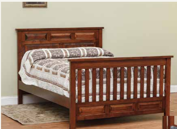
#103 • Full Sized Bed Conversion Kit Includes bed rails, slats, and hardware to easily convert crib into a full sized bed.