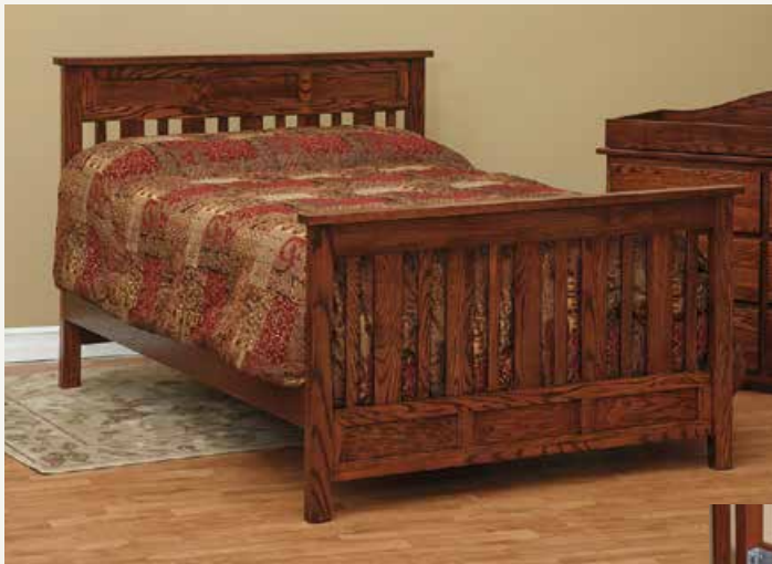
#103 • Full Sized Bed Conversion Kit Includes bed rails, slats, and hardware to easily convert crib into a full sized bed.